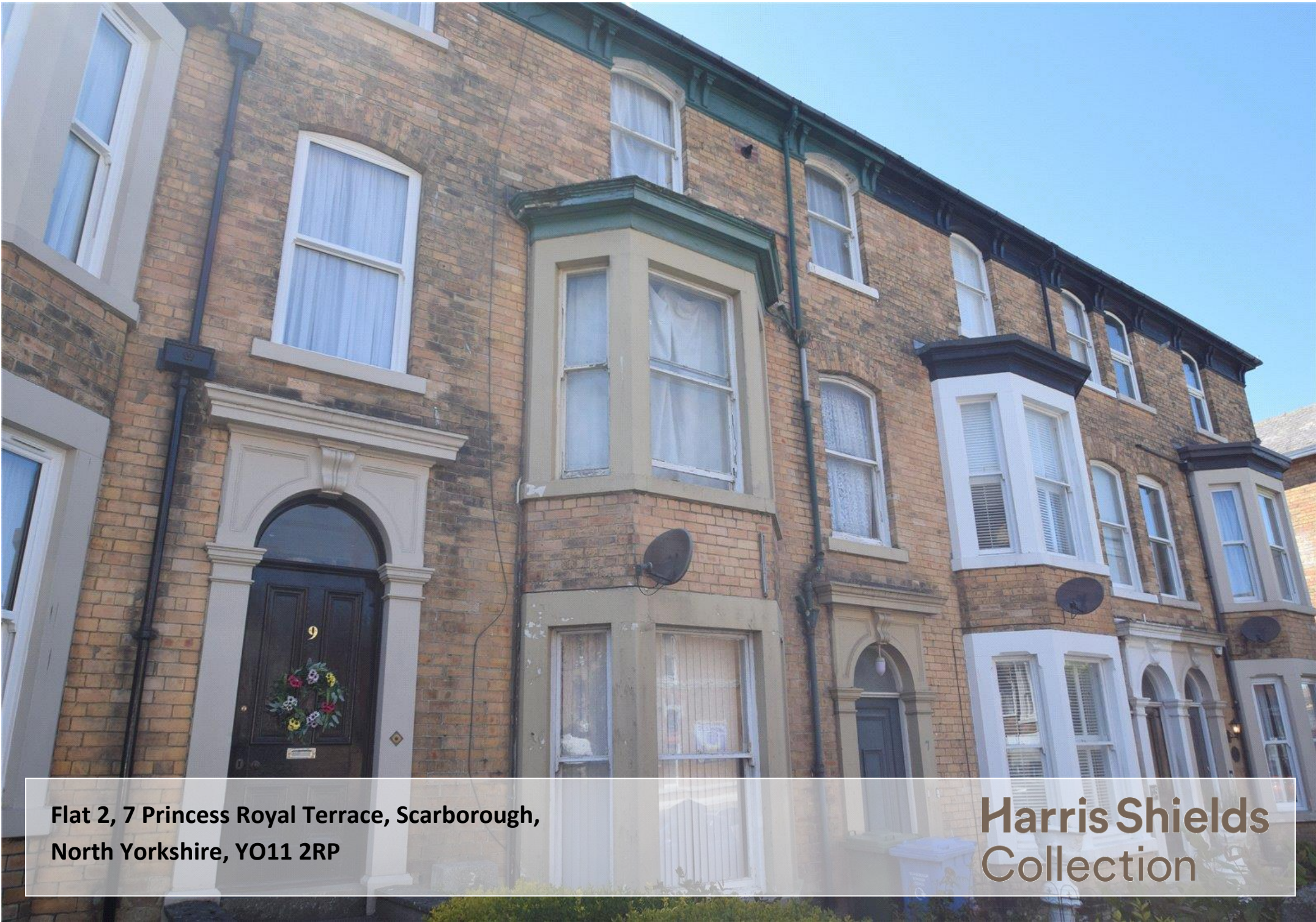
Flat 2, 7 Princess Royal Terrace, Scarborough, North Yorkshire, YO11 2RP

FIRST FLOOR 559 sq.ft. (51.9 sq.m.) approx.